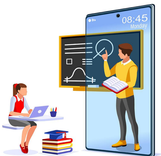
Figure 2. Blended Learning Media Using Infocus

This research was conducted in 6 meetings in the experimental group and the control group. Research provides different treatment to the two groups. The experimental group studied using a blended learning model, while the control group studied using a conventional learning model. The data obtained in this study were data collected from tests given to students in the form of pretest and posttest which were given to both groups, namely the control and experimental groups. The pretest was given before the treatment of the blended learning model was carried out to determine students' initial abilities. While the posttest is given after the treatment is carried out using the blended learning model. The instruments used in the pretest and posttest in this study included data on student learning outcomes through a cognitive test of 30 validated multiple-choice questions.