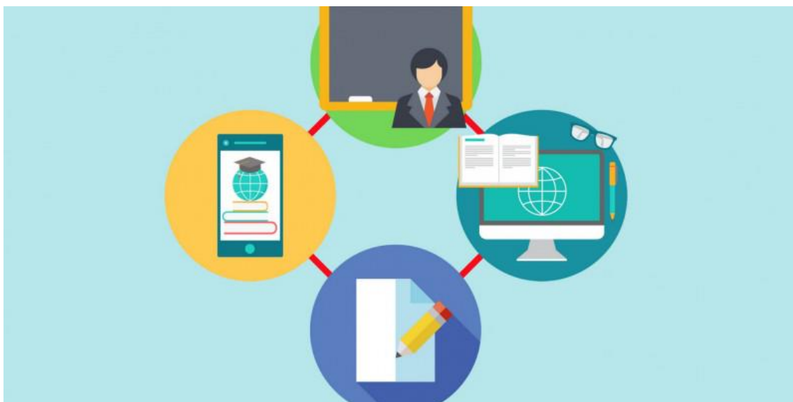
Figure 1. The media uses Blended Learning